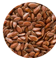
Omega 3 Fatty Acids Healthy Skin & Shiny Coat

For each recipe, our team of experts including veterinarians, food scientists, technicians and PhD nutritionists work to ensure these ingredients are tailored into a customized recipe that exceed the nutritional needs of all dogs and cats to fuel a life of wellbeing. Each carefully chosen ingredient is combined to deliver superior nutrition for each pet's unique life stage and lifestyle needs. And as a final validation check, we continue to analyze each recipe to ensure its safety and suitability with a final nutrient analysis profile that covers over 50 nutrients to ensure every dog or cat gets the stringent, precise formulation it needs.