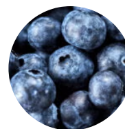
Antioxidant Vitamins Immune Health