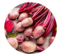
Dietary Fiber Digestive Health