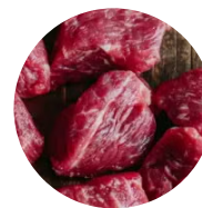
Glucosamine & Chondroitin Healthy Joints