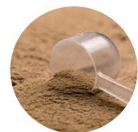
Chicken Meal Concentrated dried protein for muscle health & vitality