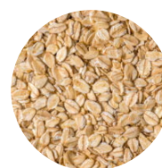
Oatmeal Carbohydrate for sustained energy/vitality