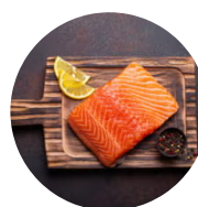
Salmon Fresh meat 1st Ingredient – Lean body condition & skin and coat health