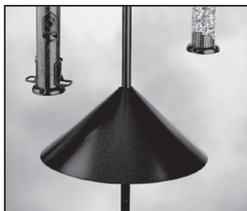
18" Squirrel Baffle (#38023) on Bird Feeder Pole (38128)