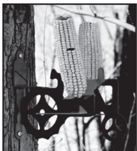
Tractor Cob Feeder (#38055)