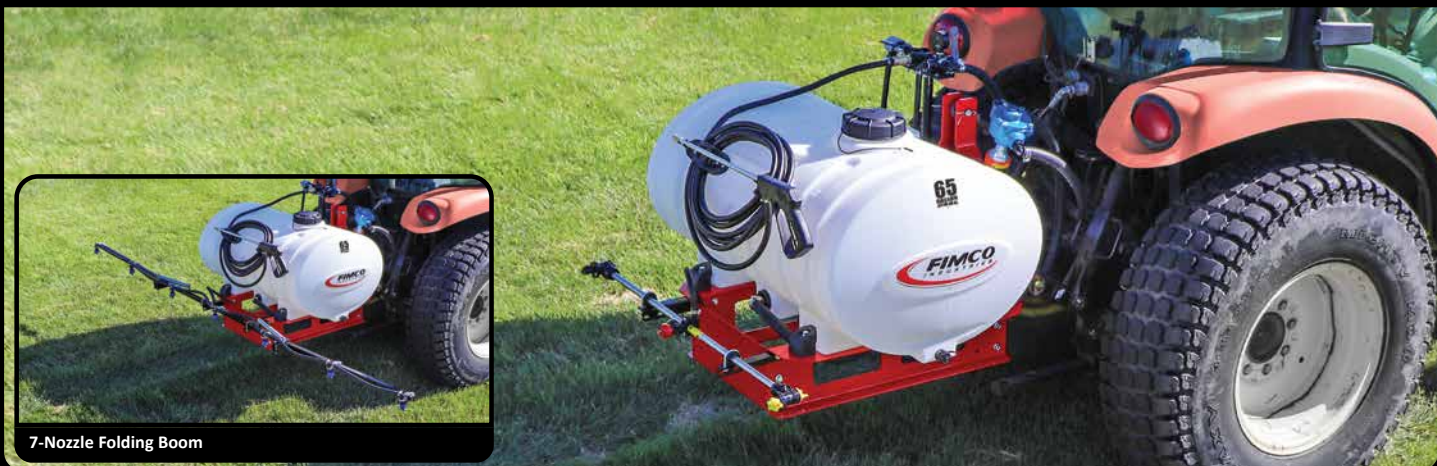
7-Nozzle Folding Boom