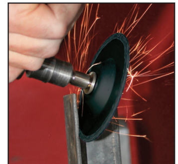
Thin Profile for Fast Cutting

BrushAll™ is a division of IPA®, dedicated to the development and manufacturing of innovative brushes and abrasives for all industries.