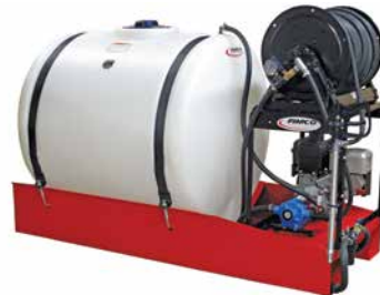
LSS-280 / LSS-280-H / LSS-280-EH