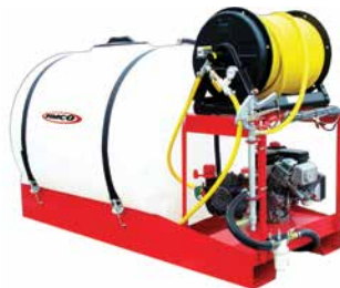
LSS-240 / LSS-235-H