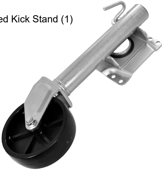
Wheeled Kick Stand (1)