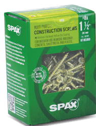
1 lb. Box