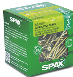
3 lb. Box