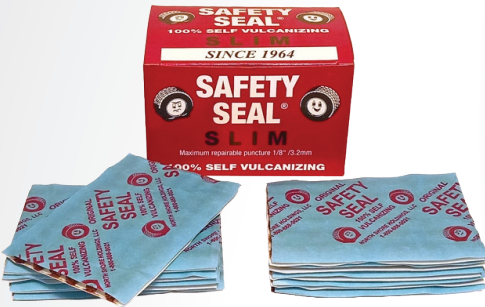
SLIM REPAIR REFILL 60 REPAIRS (4'') RS