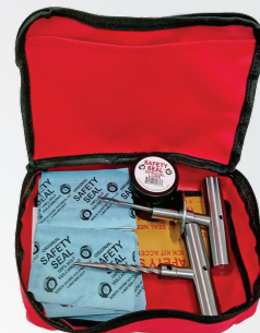
AUTO/LT DELUXE BAG KIT 60 STANDARD REPAIRS (4") KAB60