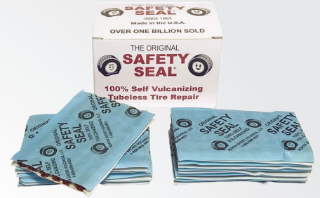
AUTO/LT REPAIR REFILL 60 STANDARD REPAIRS (4'') RA