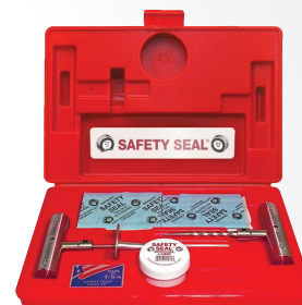
AUTO/LT DELUXE KIT 30 STANDARD REPAIRS (4") KAP30