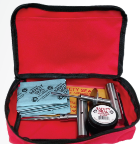
AUTO/LT DELUXE COMBI BAG KIT 18 STANDARD/12 SLIM REPAIRS (4") KABC30