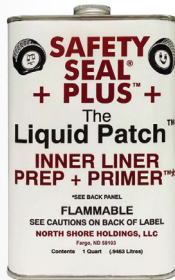
LIQUID PATCH INNER LINER PREP/PRIMER, 32 OZ (946 ML) LPIP