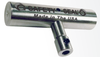
T-HANDLE ONLY PROBE (HEX) 9/32 ID PH