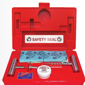
AUTO/LT DELUXE KIT 60 STANDARD REPAIRS (4") KAP60