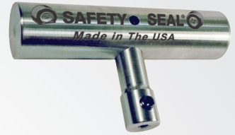
T-HANDLE ONLY NEEDLE (ROUND) 3/16 ID TH