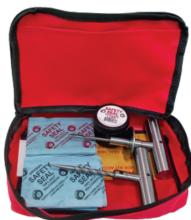
AUTO/LT DELUXE COMBI BAG KIT 30 SLIM/30 STANDARD REPAIRS (4") KABC60