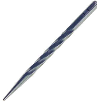
SPIRAL PROBE FOR CAR 4.75'' PN