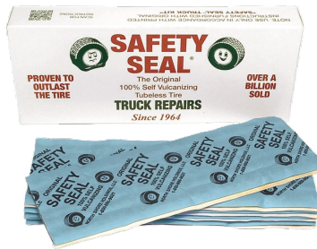
REPAIR REFILL, TRUCK 30 REPAIRS (8'') RT