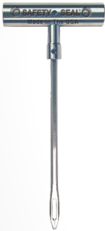
T-HANDLE WITH HEAVY EQUIPMENT INSERTION NEEDLE THE