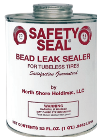
BEAD LEAK SEALER 32 OZ (946 ML) BL