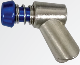
ATV INFLATOR ADAPTOR INF