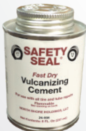
VULCANIZING CEMENT FAST DRY, 8 OZ 24-008