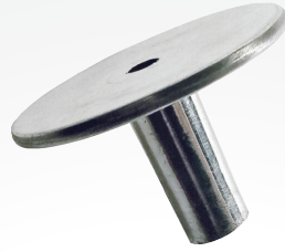
SLEEVE FOR INSERTION TOOL SL