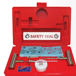
AUTO/LT DELUXE COMBI KIT 30 SLIM/30 STANDARD REPAIRS (4") KAPC60