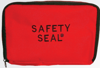
EMPTY FABRIC BAG KBF