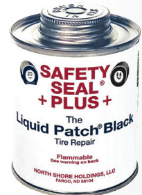
LIQUID PATCH BLACK 16 OZ (473 ML) LPCB