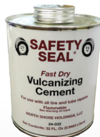
VULCANIZING CEMENT FAST DRY, 32 OZ 24-032