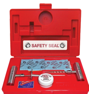
AUTO/LT DELUXE COMBI KIT 18 STANDARD/12 SLIM REPAIRS (4") KAPC30