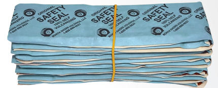
HEAVY EQUIPMENT REPAIR REFILL 30 REPAIRS (16'') RHE