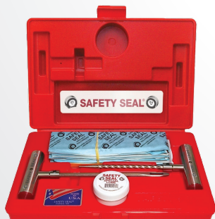
HEAVY EQUIPMENT KIT 18 REPAIRS (16"), 7" PROBE KHE