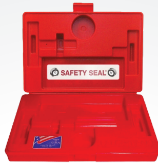
EMPTY PLASTIC DELUXE BOX KBP