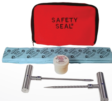
HEAVY EQUIPMENT BAG KIT 18 REPAIRS (16"), 7" PROBE KHEB