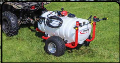
65 Gallon 3-Nozzle Broadcast Trailer Sprayer