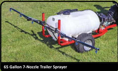
65 Gallon 7-Nozzle Trailer Sprayer