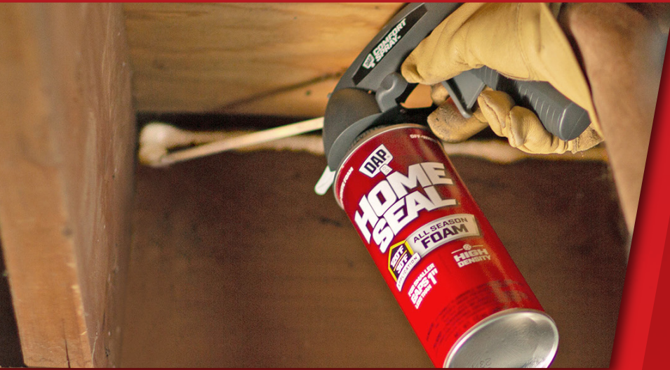
Shown with DAP® Comfort Spray™ Universal 1-Component Straw Foam Applicator (sold separately, product # 7565070230).