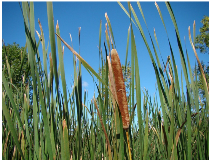
Figure 1. For use in Aquatic and Other Noncrop Sites. Such as purple loosestrife, cattails, reed canary grass and phragmites.