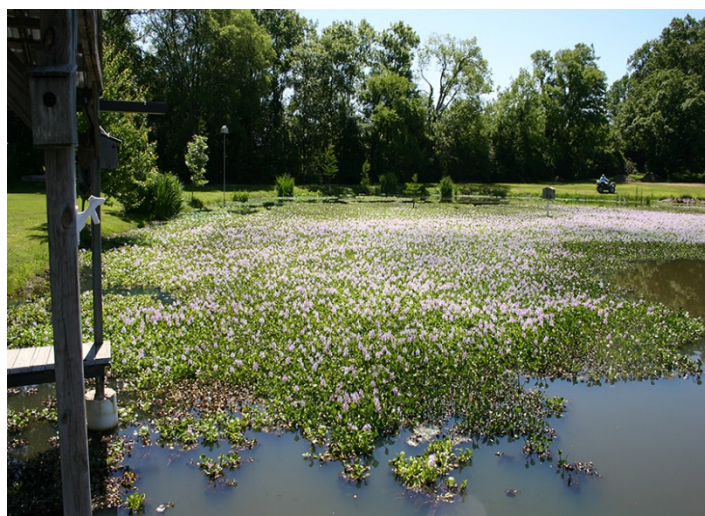
Figure 2. Effective on Water Hyacinth