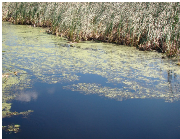
Figure 2. Ideal for controlling nuisance aquatic weeds like duckweed. (Use with aquatic use surfactant.)