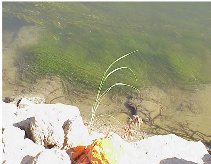
Figure 1. For use in treatment of residential ponds and control of submerged weeds.