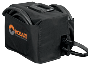
Protective Cover 770771 Weather-resistant nylon resists stains and mildew while protecting the finish of your plasma cutter.