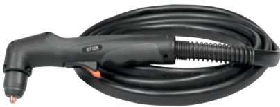
XT12R Replacement Torch 268919 12 ft. (3.7 m)