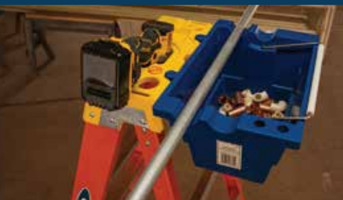
LOCK-IN™ accessory system secures tools and expands ladder top