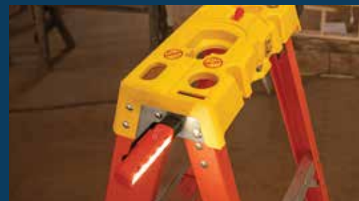
Metal plate holds magnetic accessories like flashlights & laser levels