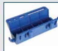
JOB CADDY Model AC54-JC