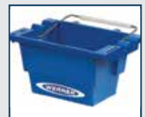
JOB BUCKET Model AC50-JB-3