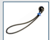
TOOL LASSO Model AC58-TL

*All LOCK-IN™ Accessories sold separately.