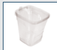
PAINT CUP LINER Model AC27-L

Ask your Sales Representative for details and availability.