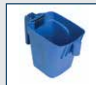
PAINT CUP Model AC27-P