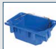
UTILITY BUCKET Model AC52-UB