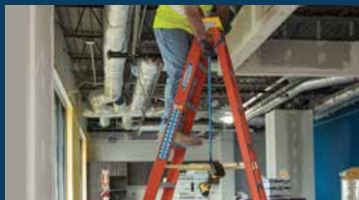
Three position anchor points prevent tools from accidentally falling while working at height