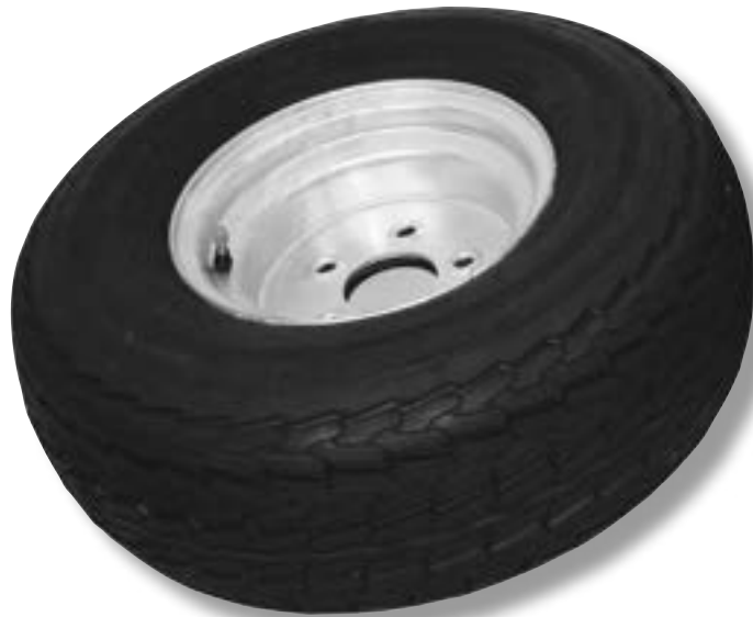
Full Size Spare Tire (1)