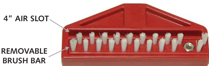
ASSEMBLED BRUSH HEAD UP CLOSE