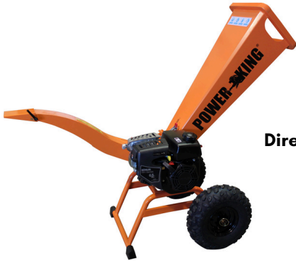
2.8IN Residential Direct Drive Chipper Shredder PK0913DD