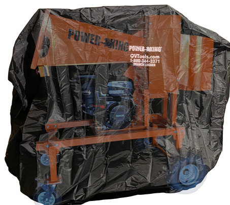
PK092103 - All Weather Cover for PK0921/PK0921-EH 5" Wood Branch Logger