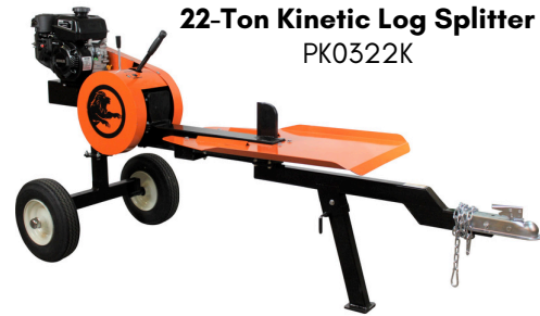
22-Ton Kinetic Log Splitter PK0322K