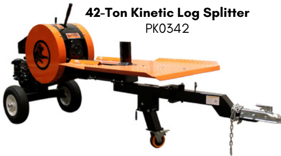
42-Ton Kinetic Log Splitter PK0342