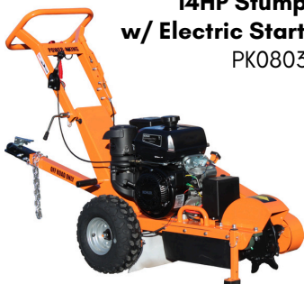
14HP Stump Grinder w/ Electric Start / Hour Meter PK0803-EH