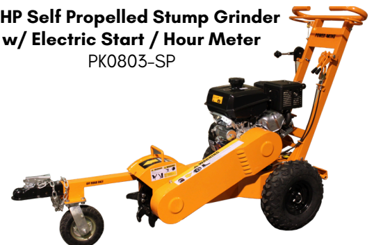
14HP Self Propelled Stump Grinder w/ Electric Start / Hour Meter PK0803-SP