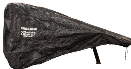
PK0322K17 - All Weather Cover for PK0322K 22-Ton Kinetic Log Splitter