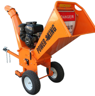
4IN Commercial Chipper Shredder PK0903