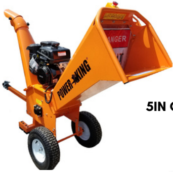
5IN Chipper Shredder w/ Electric Start PK0915-EH