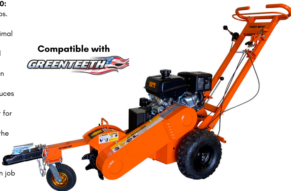
PK0803-SP - 14HP Electric Start Stump Grinder with Hour Meter UPC: 037229991598

The Power King 14HP stump grinder combines power and ease of use, featuring self-propulsion for easy movement and electric start for convenience. Its design includes an adjustable handle for comfort, dual brakes for safety, and large tires to navigate rough terrain easily. This model is equipped with 9 durable, carbide-tipped teeth and is compatible with Green Teeth, offering efficient stump removal. Additionally, it has a tow bar for transport and an hour meter to track usage, making it a practical tool for both professionals and homeowners.