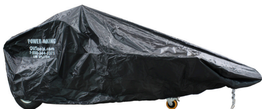
PK034211 - All Weather Cover for PK0342 42-Ton Kinetic Log Splitter