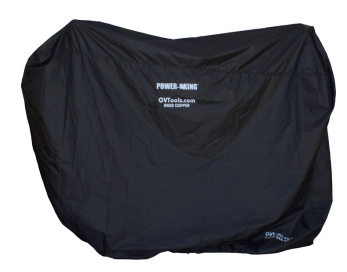
PK091514 - All weather cover for PK0915-EH 5", PK0915 5", PK0903 4" Chipper Shredder