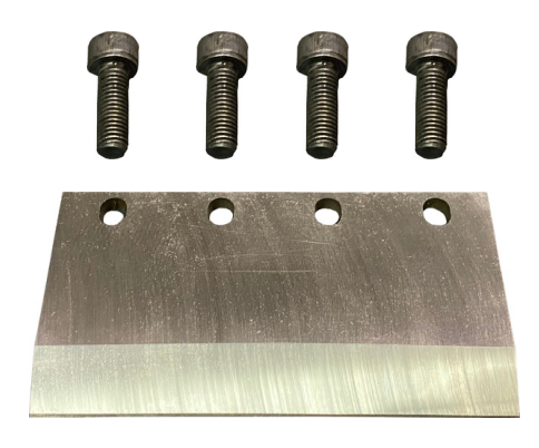
PK09210101 - Replacement Blade for PK0921/PK021-EH 5" Wood Branch Logger