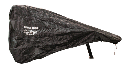
PK0322K17 - All Weather Cover for PK0322K 22-Ton Kinetic Log Splitter