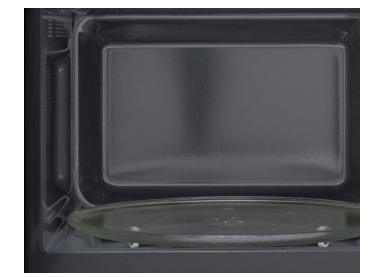
Stylish Gray Interior

With decades of experience designing innovative cooking appliances, it's easy to see why home cooks throughout the world trust Sharp Carousel.