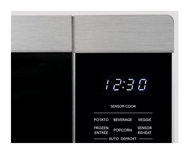
Premium White LED Display is Easy to Read