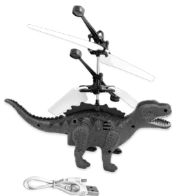
Figure 1 Dino Cyber Flyer & Charging Cord