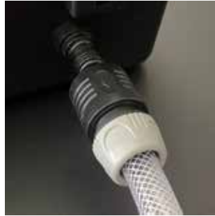
Connect clear hose with a click.

Step 3: Attach your outlet hose (red) to the second inlet (red) located on the left side of your tank. BE SURE THE RED RUBBER PLUG IS REMOVED. Make sure when attaching the hose you hear a "CLICK" as this ensures the hose is securely fastened.