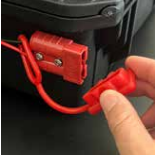
Remove plug cap

Step 1: To begin operating your new HydroSpray you will need to plug your power cord into the Anderson outlet (red) located on the right side of your box. Make sure you hear a click, this ensures a tight fit. You can choose between the 12V cigarette lighter attachment or the battery terminal attachment. Please note RED goes to Positive (+) and BLACK goes to Negative (-). Make sure you remove the silicone cover before plugging any terminals into your box.