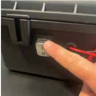
Turn on the pump.

Step 5: Turn your system to the “ON” position by pressing down on the switch located on the right side of the box. If you are using the 12V Cigarette Adapter make sure the switch on the plug is in the “ON” position. If you are using the terminal clips you only need to turn the system “ON” via the box ON/OFF switch.