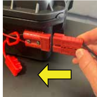
Plug in until you hear a click.