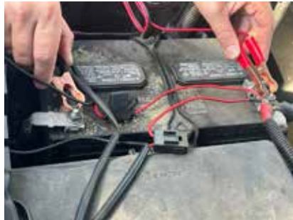
Battery terminal adapter Red goes to Positive (+), Black goes to Negative (-)