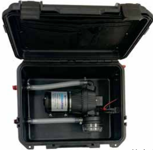
HydroSpray Pump System