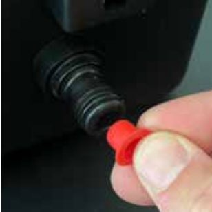
Remove red plug.

Step 3: Attach your outlet hose (red) to the second inlet (red) located on the left side of your tank. BE SURE THE RED RUBBER PLUG IS REMOVED. Make sure when attaching the hose you hear a "CLICK" as this ensures the hose is securely fastened.