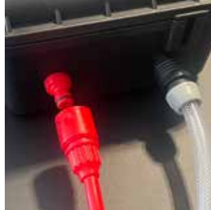
Connect red hose with a click.

Step 4: Insert your spray nozzle into the red hose, make sure you hear a "CLICK" as this ensures the hose is securely fastened.