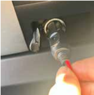
Cigarette lighter adapter