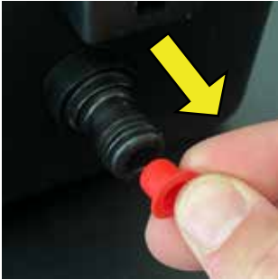
Remove red plug.

Step 2: Attach your clear hose (hose with orange filter) to the inlet quick connect located on the right side of the box (Black colored). BE SURE THE RED RUBBER PLUG IS REMOVED. This will be the inlet that feeds to the pump's filter. Make sure when attaching the hose you hear a "CLICK" as this ensures the hose is securely fastened.