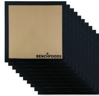
10 Pack Bundle