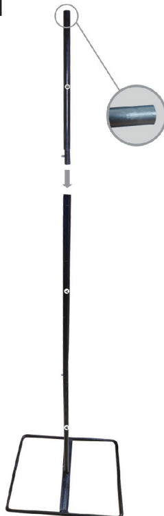
Insert and snap lock the metal pole labeled "B" into the assembled metal pole.