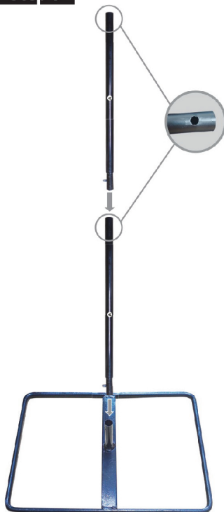
Insert and snap lock the two metal poles labeled "A" into the base.