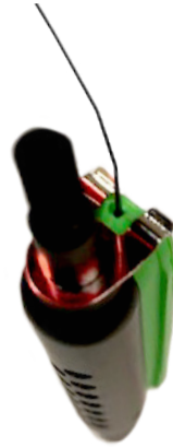
Wire between prongs