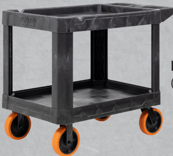
KT-01 (no armour)

The KNAACK Transport provides the same mobility, durability, and easy assembly without the security armour.