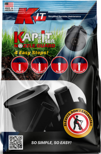
KAP-IT Body Extender