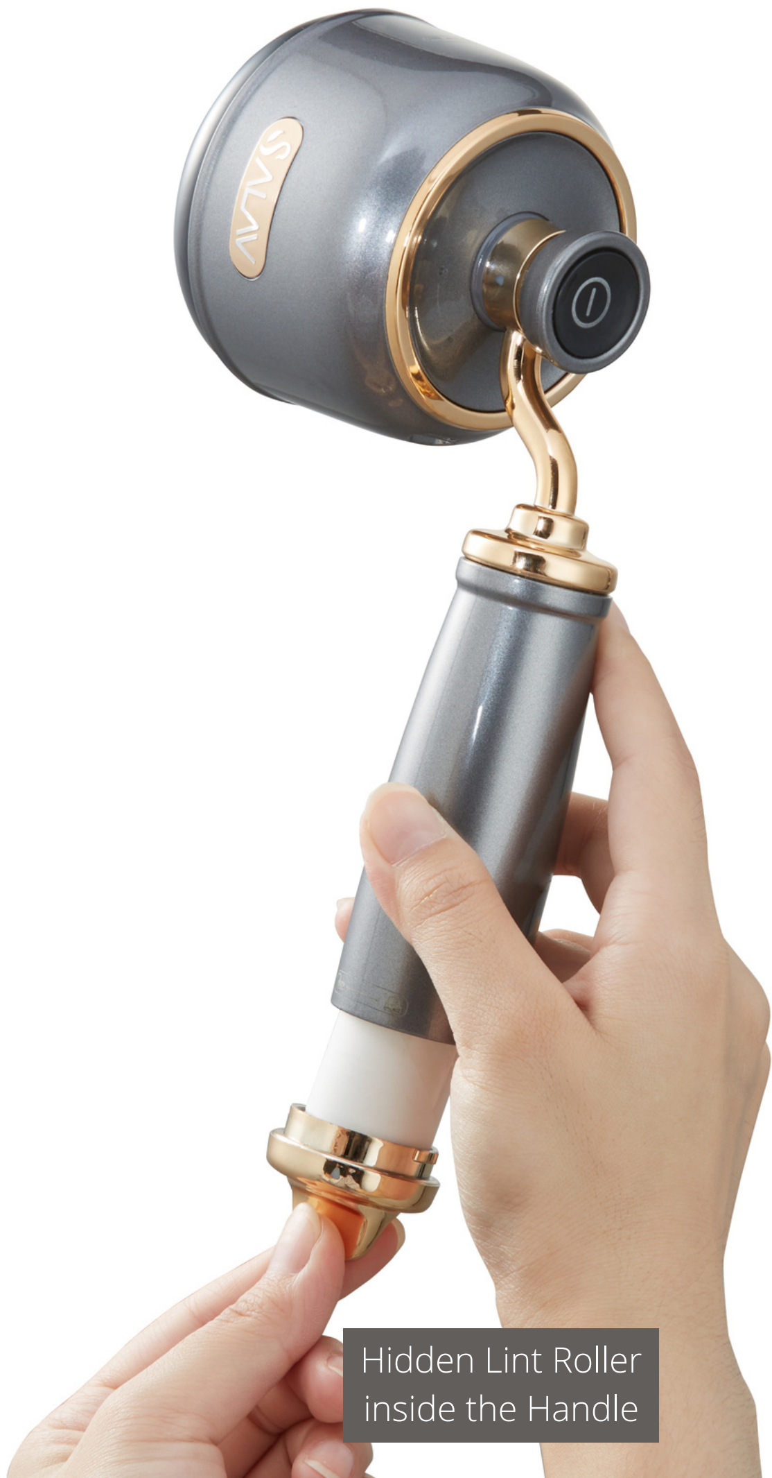
Hidden Lint Roller inside the Handle