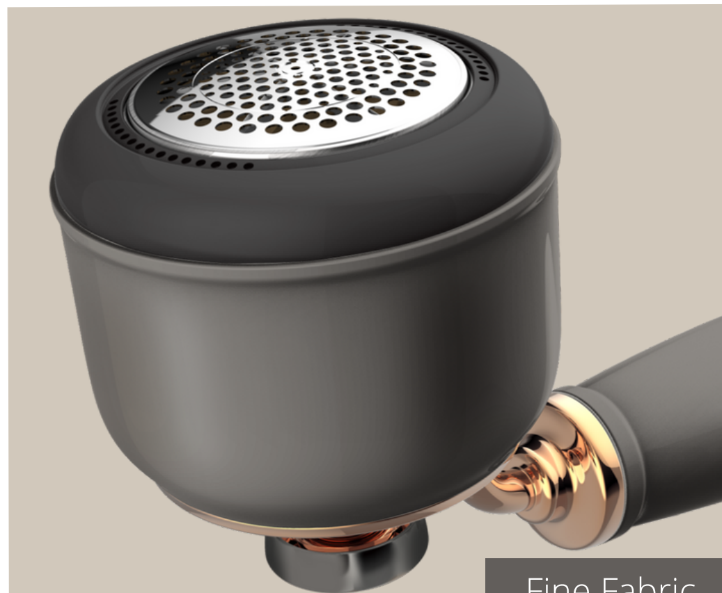
Fine Fabric Shield