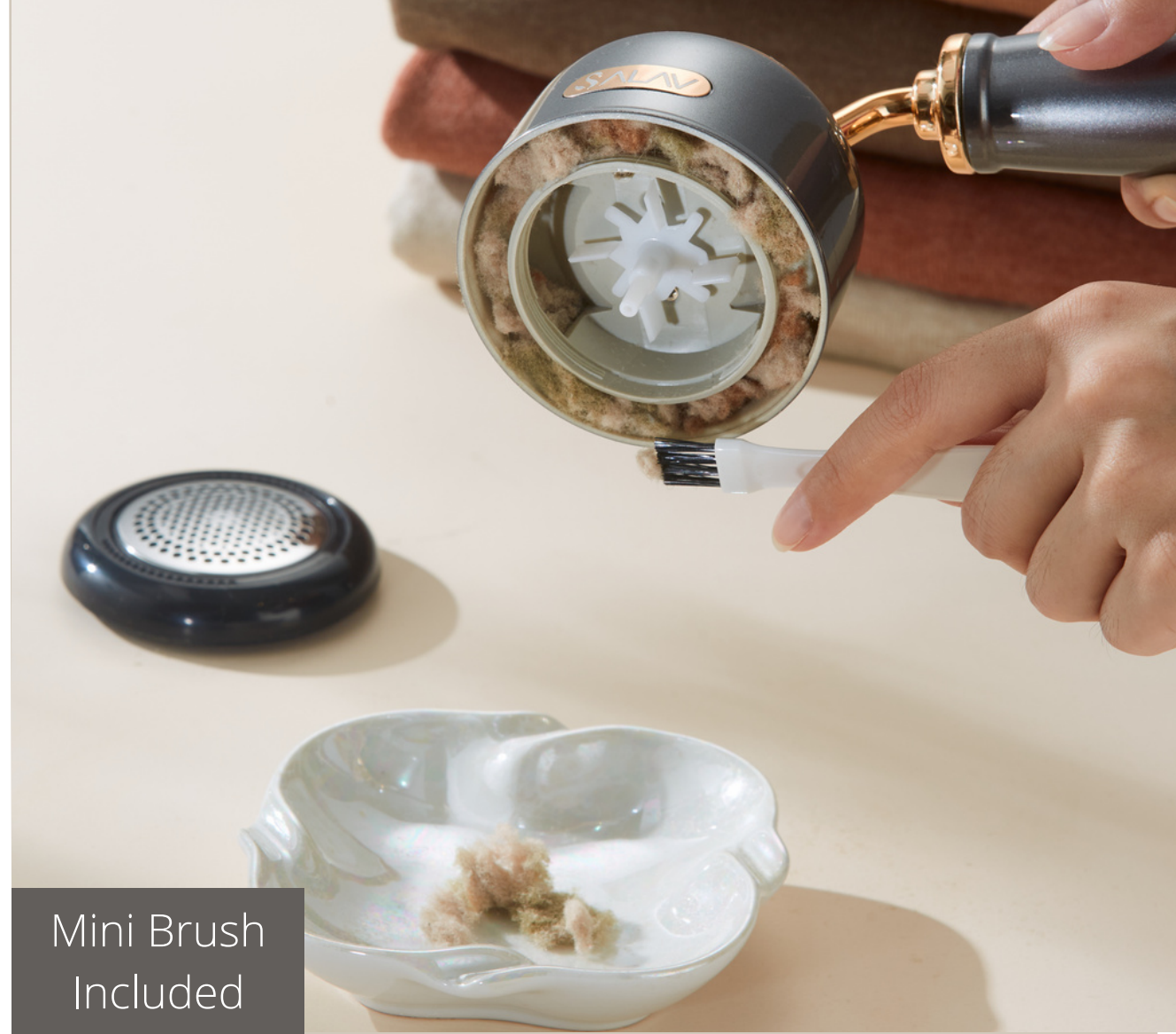
Mini Brush Included