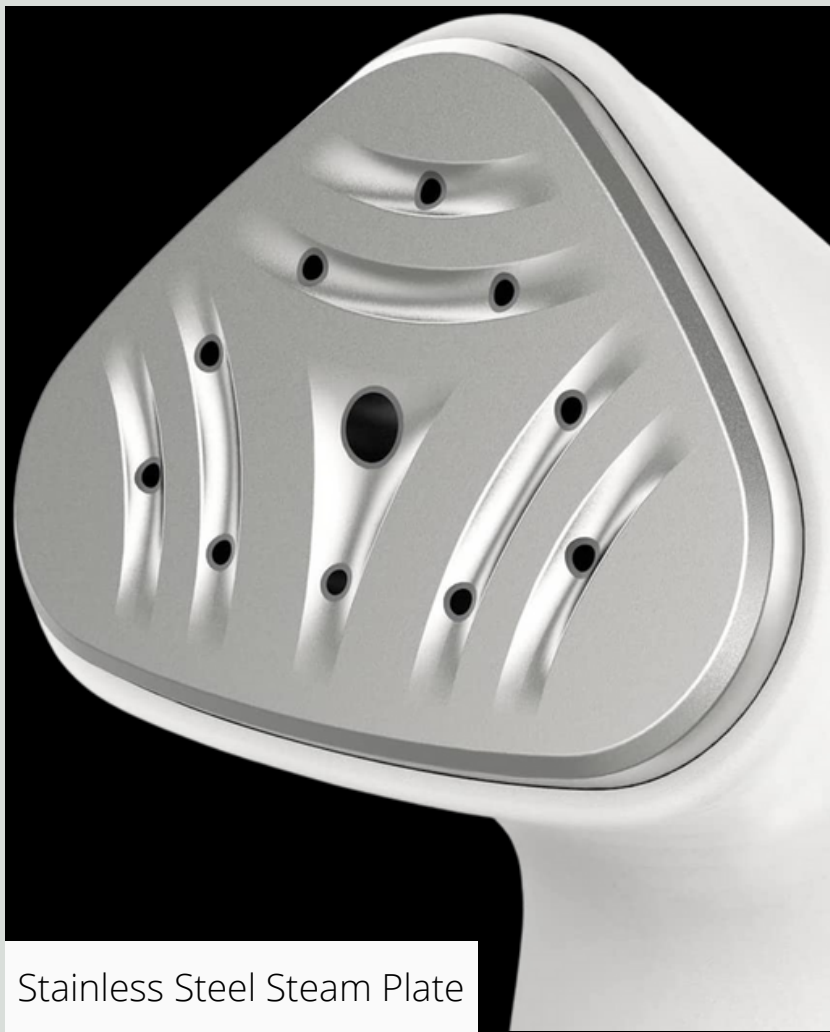
Stainless Steel Steam Plate