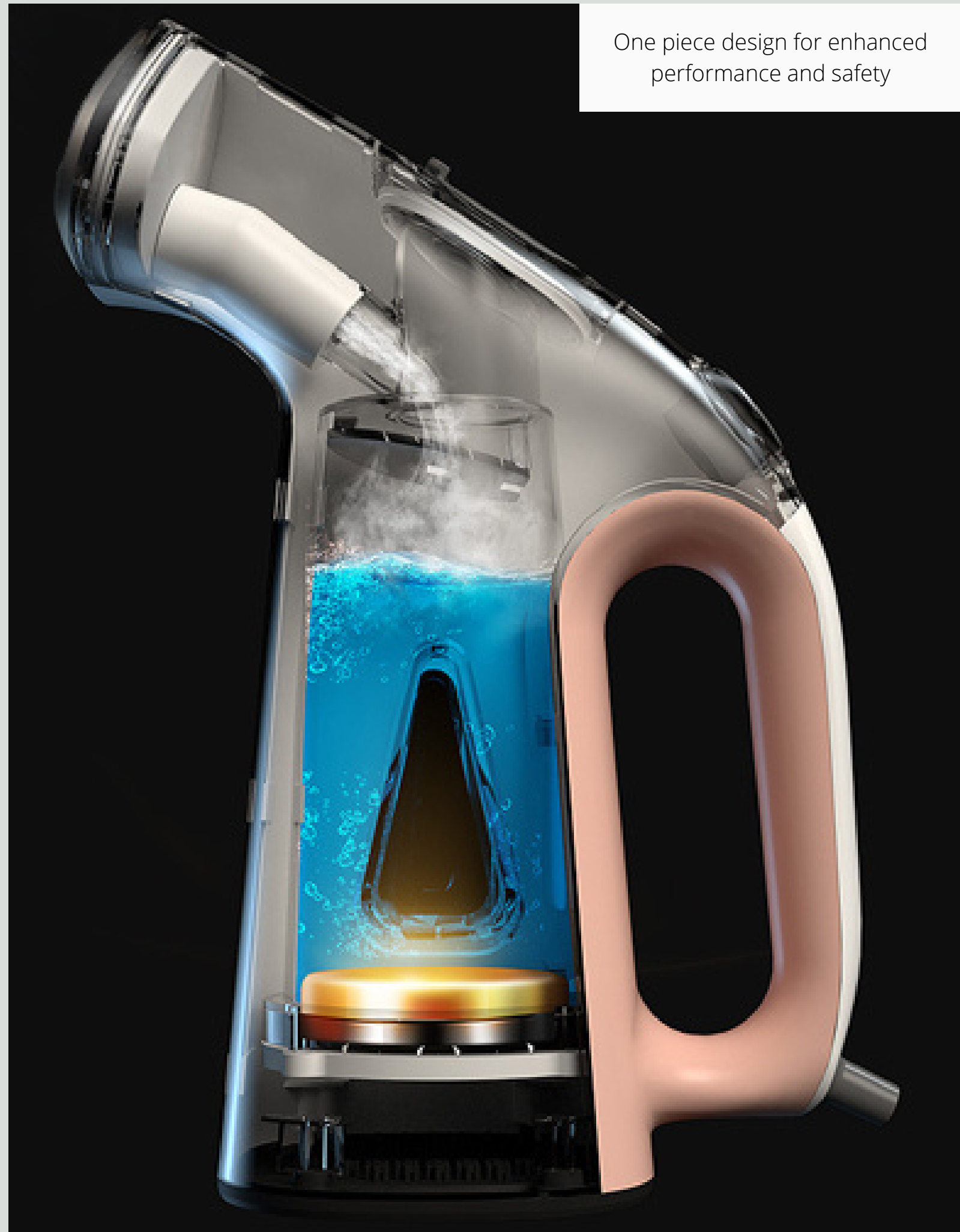
One piece design for enhanced performance and safety