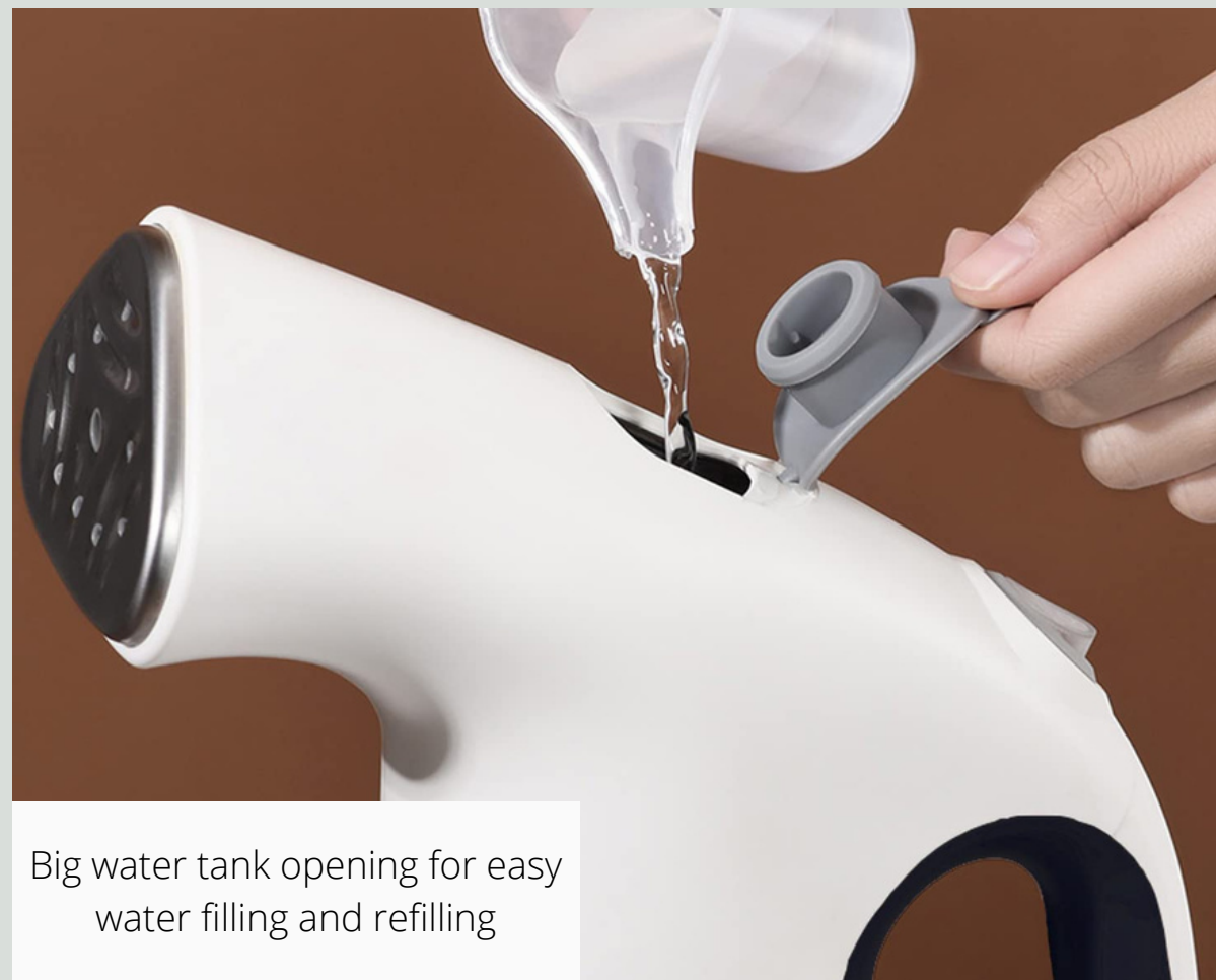
Big water tank opening for easy water filling and refilling