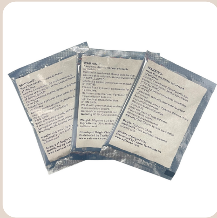
3 packs of decalcifier