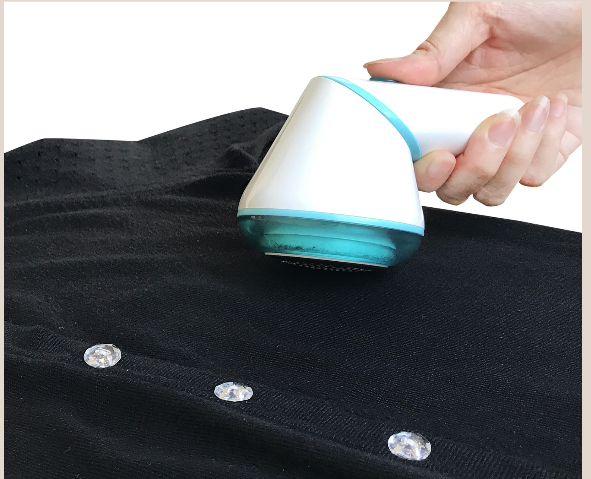
90 Degree adjustable handle for horizontal or vertical use