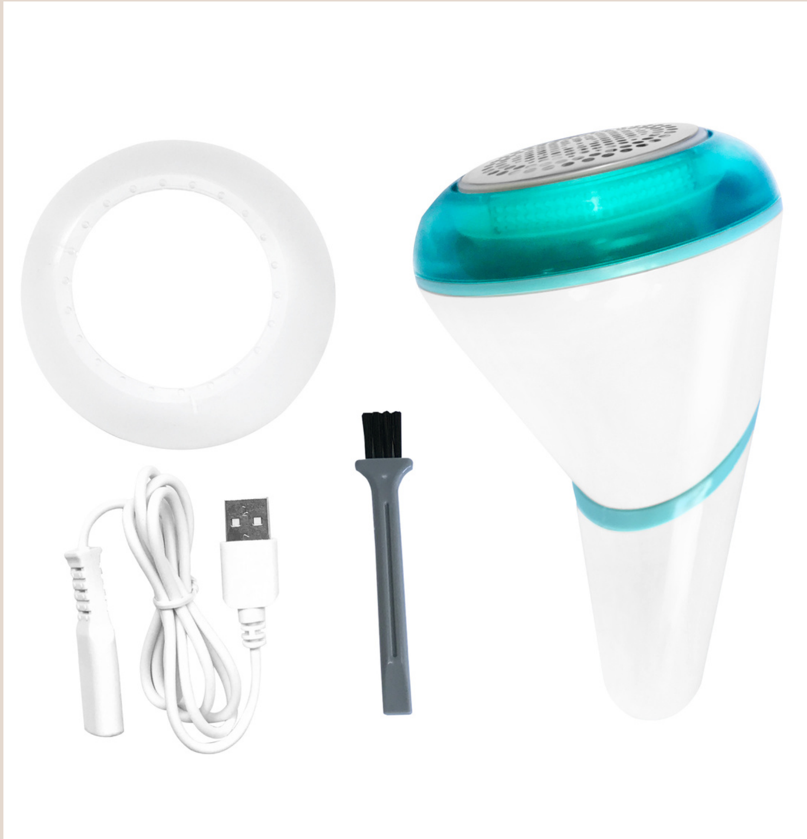
Comes with a USB charging cable, protective cover, cleaning brush