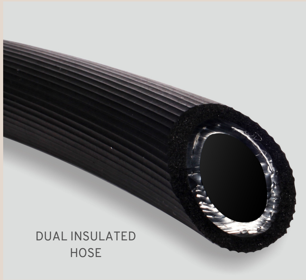
DUAL INSULATED HOSE