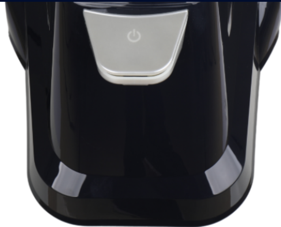
Foot Pedal Power Control