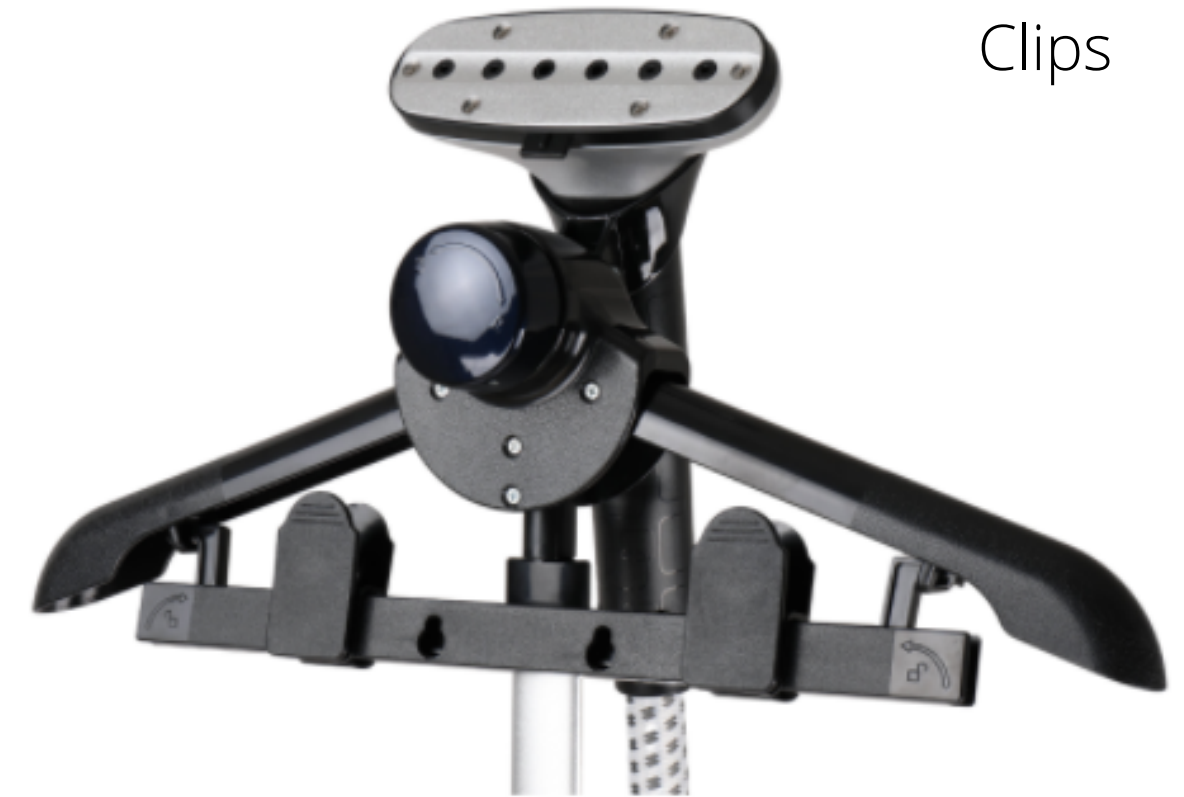
360 degrees Swivel Hanger with Hanger Clips