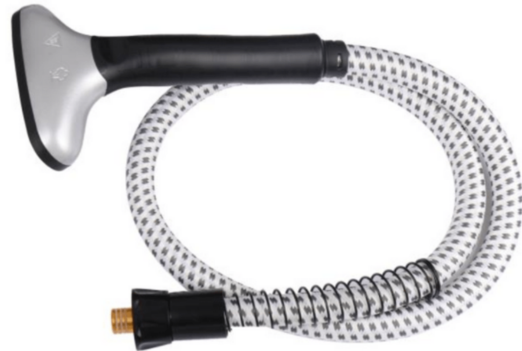
Dual-insulated Woven Hose w/ Brass Connector