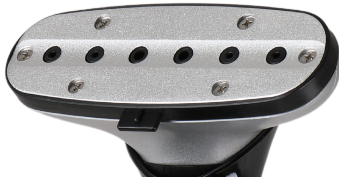
Heavy duty aluminum plated steam nozzle