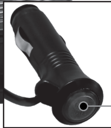
Flash Pattern Selector