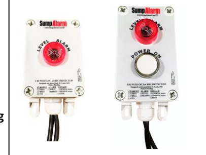
Figure 1 – 2L & 1L Head Unit

Read and follow all instructions and safety guidelines thoroughly before installing or operating the system. Failure to follow the instructions could result in serious bodily injury or death and/or property/pump damage.