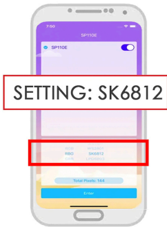
2 Set Protocol and Color to match device specifications if needed.