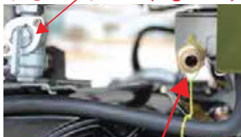
LP Gas Inlet