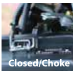
Closed/Choke (Figure C)