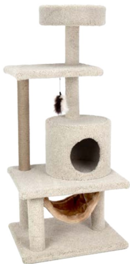
ASSEMBLED DIMENSIONS 24" X 20" X 55" (H)

• Vacuum your cat tree prior to initial use to remove any packaging debris.