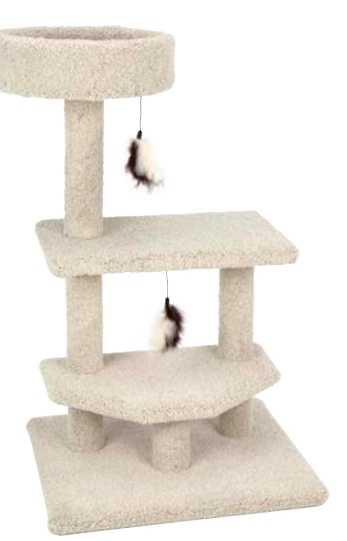
ASSEMBLED DIMENSIONS 24" X 20" X 40" (H)