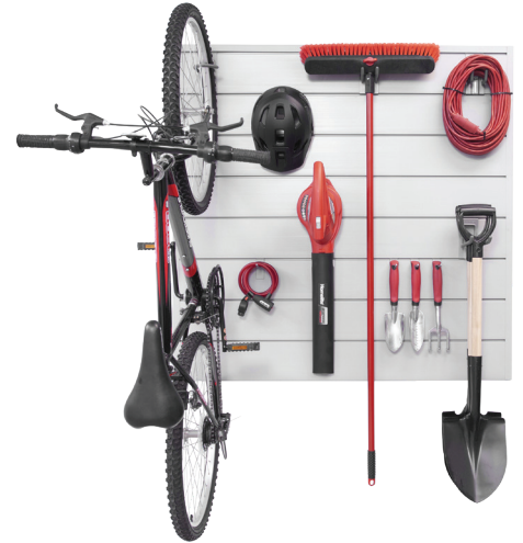
Accessories and items shown not included