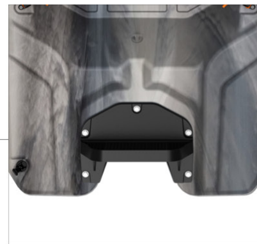
SKEG (COMPATIBLE PELICAN TRANSOM)