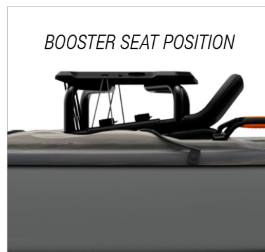
BOOSTER SEAT POSITION

TRACKING Ideal for those looking to cover long distances with minimum force.