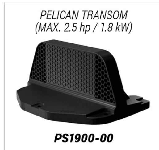
PELICAN TRANSOM (MAX. 2.5 hp / 1.8 kW)