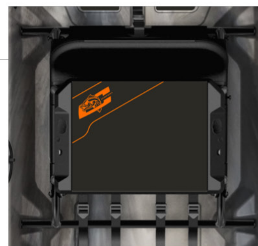
ERGOBOOST™ SEATING SYSTEM