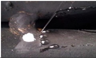
Failed weld or failed material covered under warranty