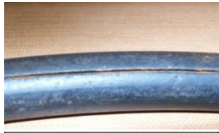
Failed pipe seam covered under warranty