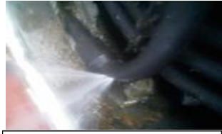
Blow out from pipe weakened by freezing