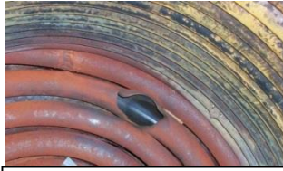
Pipe rupture due to freezing or obstruction

TEMPERATURE SWITCH: The burner is equipped with a high temperature limit switch, which will shut off the burner when the water temperature becomes too hot. Hot water machines are equipped with an adjustable thermostat so that the operator can control the outlet water temperature. The burner will automatically cycle on and off to maintain the desired temperature.