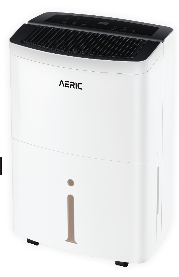
Dimensions (in.): 13.6 (W) x 9.6 (L) x 19.9 (H) Total Weight: 32.4 lbs