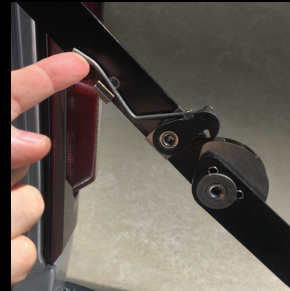
Engage the ratchet action by releasing the clips on both arms.