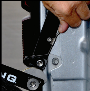
Ratchets can be easily disengaged using your finger or tool provided.