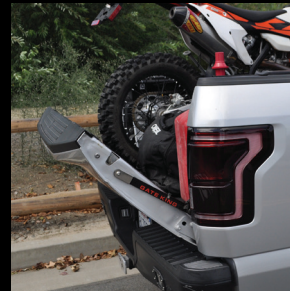
Position your tailgate to contain all the items in your truck bed.