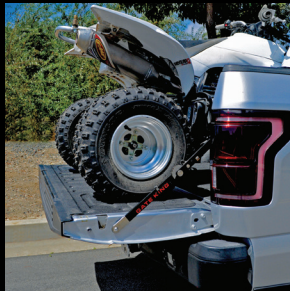
Chromoly arms are superior in strength to stock tailgate cables.