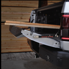
Safely shift the weight of oversize loads to the front of your bed.