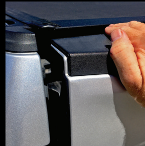
Ratchets disengage automatically simply by closing tailgate.