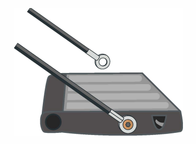
1. Lower tailgate and remove one side of the attached cables. Leave the other side attached to support the tailgate during installation.