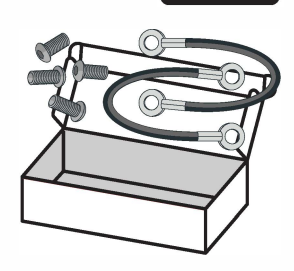
5. Want to keep your stock cables and hardware? Our box is the perfect way to store your old tailgate cables and screws.