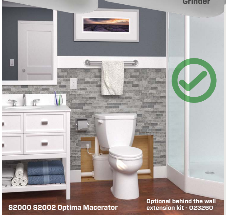
S2000 S2002 Optima Macerator