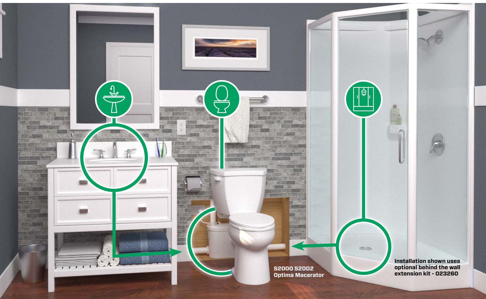
S2000 S2002 Optima Macerator

All Powerflush Optima and Optima Pro solutions are 100% factory tested