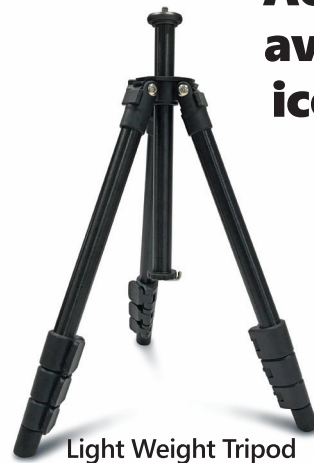
Light Weight Tripod