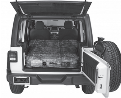
Also Available in