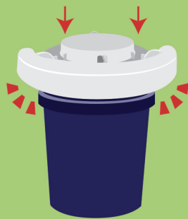
Attach waterer base to bucket