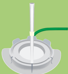
Attach hose and insert tube as shown