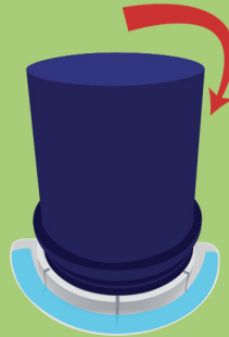
Flip bucket onto level surface