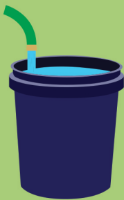
Fill bucket with water