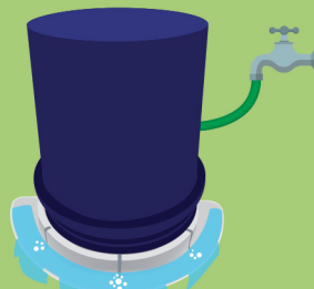
Run water until air bubbles stop