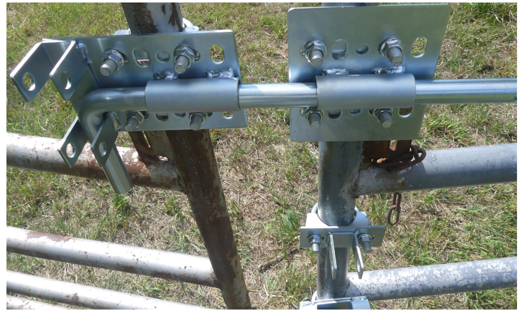
Your finished installation should look like this The set can be set up so that the bolt can slide from either side

To control livestock, you need gate hardware that has purpose-built design and is rugged enough for serious pressure from animals. Our design includes 3mm thick stamped and precision welded brackets with a corrosion and rust resistant 96-hour salt spray rated zinc electroplate finish. The rod is 15" long and a very robust 20mm (nominal 3/4") diameter, strong enough to keep the most rambunctious animals contained. The set installs without welding, a combination wrench or ratchet does the job in just a few minutes. The brackets have been punched so the clamps make a perfect fit on 1 1/2", 1 3/4", or 2" tubular steel vertical or horizontal farm gate members. In addition, there are ample round holes for mounting to wood posts or gates. The clamps have been custom manufactured with a flat inside radius so that they make maximum contact and grip on tubular steel gate members without crimping or crushing.