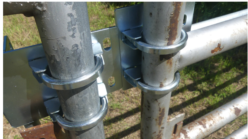
2 clamps on each bracket insures a solid connection. The clamps have a flat inside perimeter so that they make a secure connection to the gate tubing without pinching.