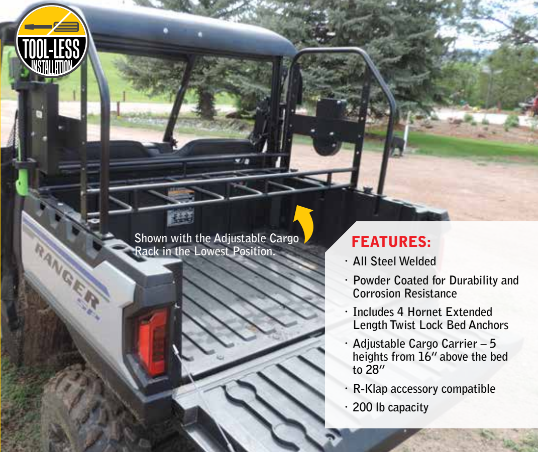
Shown with the Adjustable Cargo Rack in the Lowest Position.