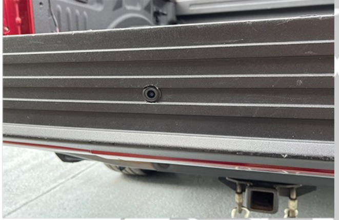
License Tag Camera - or - Top Mount Camera